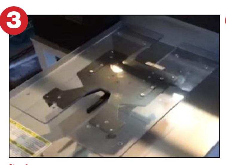
Step 3: Install the T-Lock H-Base Insert so T-Lock brackets slide into the slots in T-Lock Base.